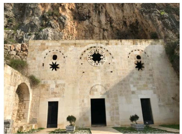
Saint Pierre's Church, Antakya