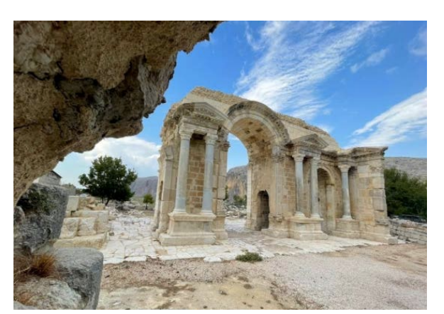
Anavarza ancient Roman road, Adana