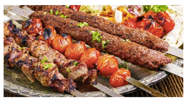
Adana Kebap, Adana