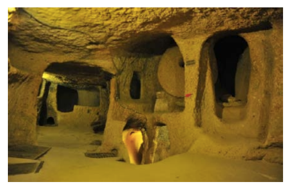
Underground City, Capadocia