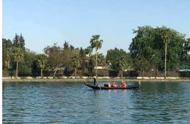
Seyhan River, Adana