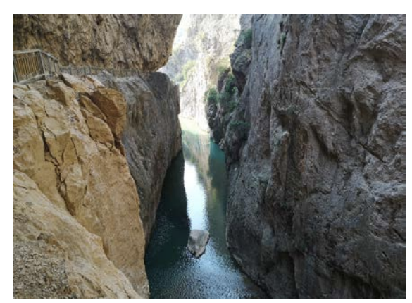
Kapıkaya Canyon, Adana