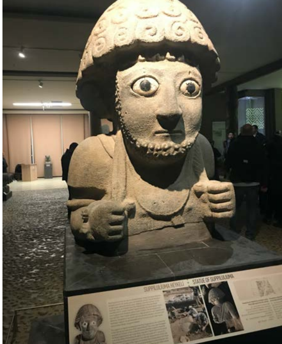
Antiochia Museum, Antakya