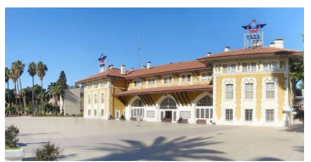
Train Station, Adana