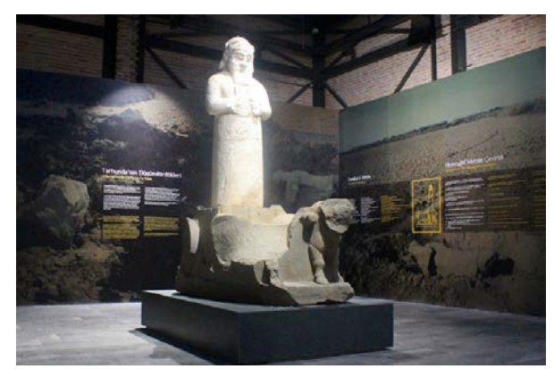
Adana Archeology Museum, Adana