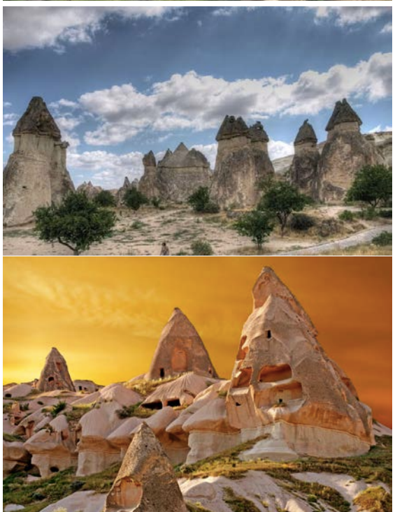
Fairy Chimneys, Cappadocia