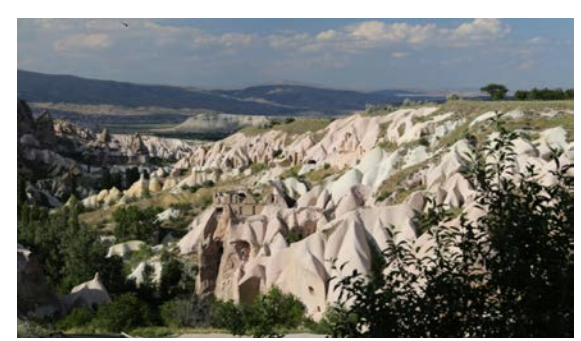
Pigeon Valley, Cappadocia