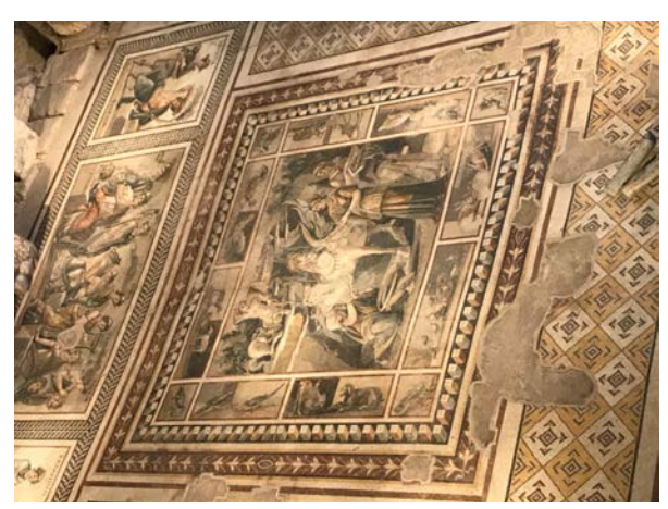
Museum Hotel, Antakya