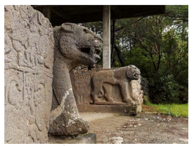
Karatepe- Aslantaş Open Air Museum, Kadirli