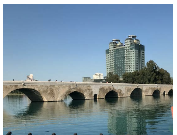
Stone Bridge, Adana (ancient Roman bridge)