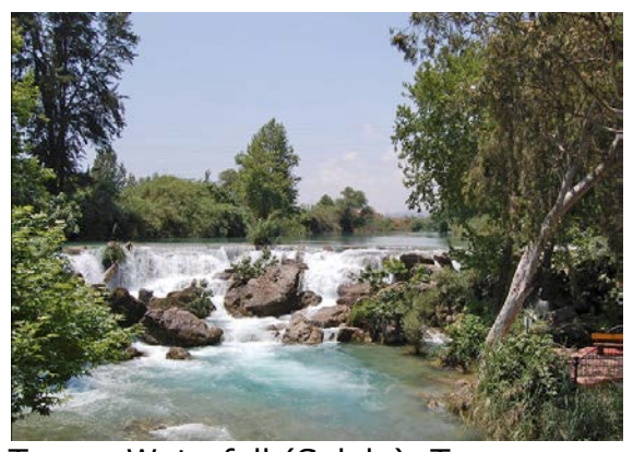
Tarsus Waterfall (Şelale), Tarsus