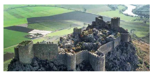
Yılankale (Snake Castle), Adana