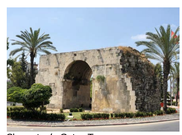
Cleopatra's Gate, Tarsus