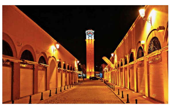
Old Clock, Adana