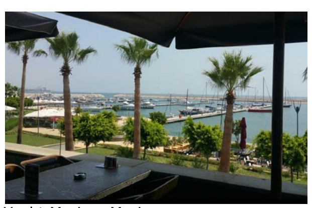
Yacht Marina, Marina