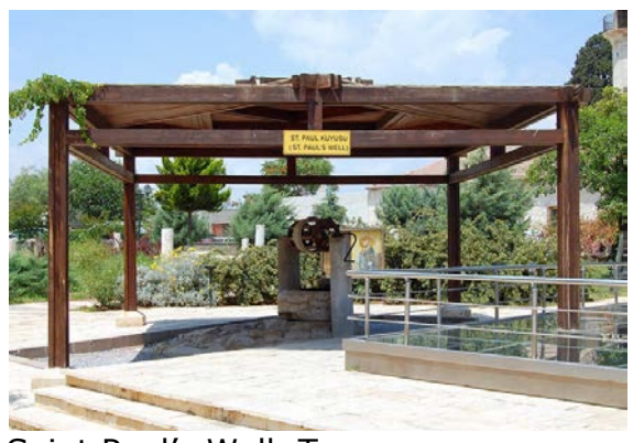
Saint Paul's Well, Tarsus