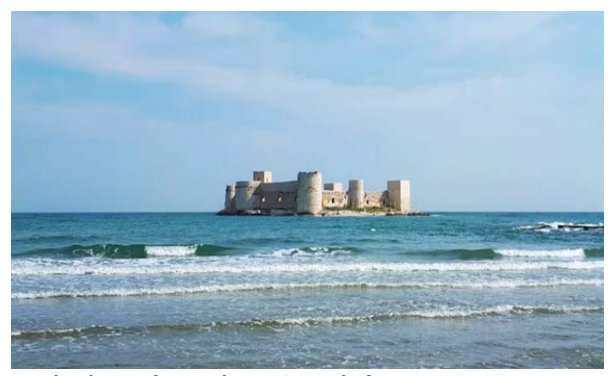
Kızkalesi (Maiden Castle), Mersin