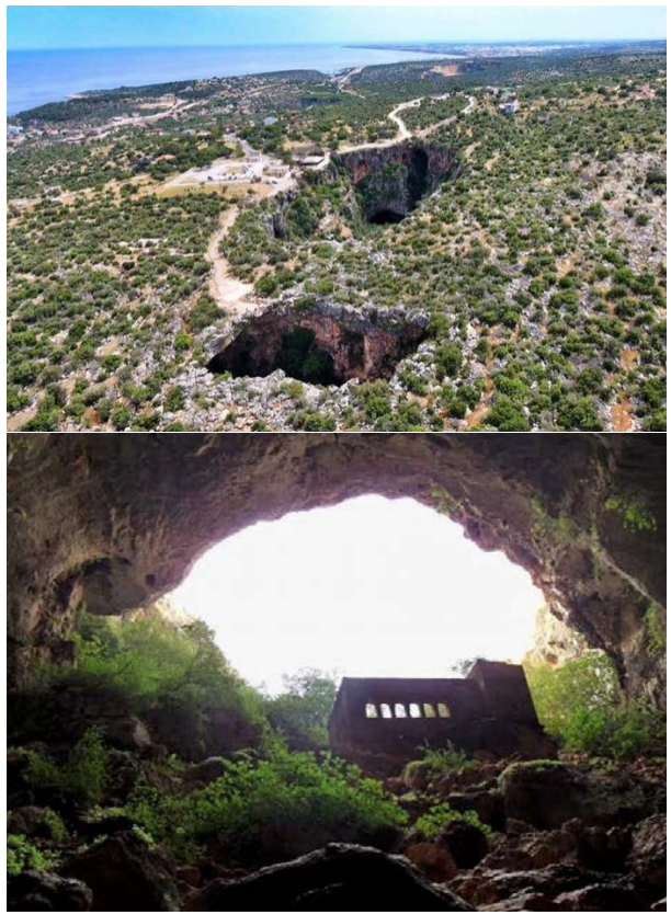
Heaven & Hell Sinkholes (Cennet Cehennem), Mersin