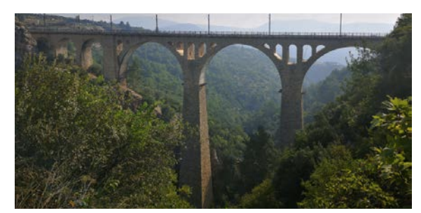
Varda Bridge, Karaisalı, Adana