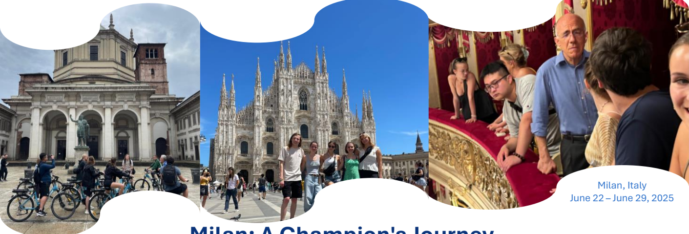
Milan, Italy June 22 – June 29, 2025