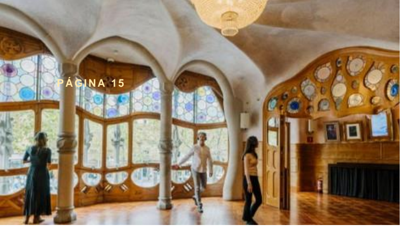
CASA BATLLO LIVING ROOM