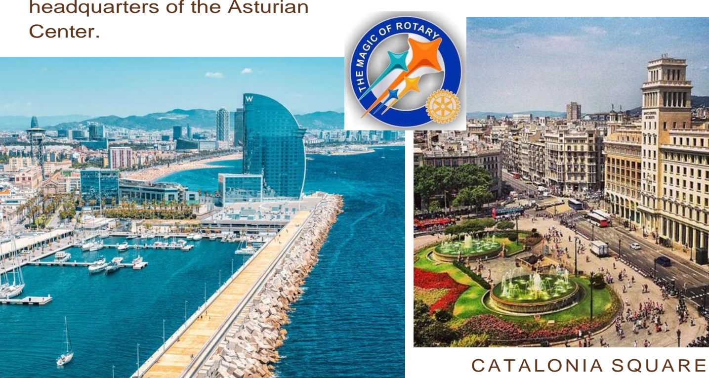
BARCELONA COAST AND W HOTEL

After dinner, return to the Pere Tarrès Hostel, by metro or by bus. Accommodation