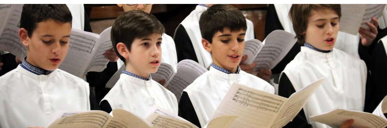
MONTSERRAT CHOIR SCHOOL