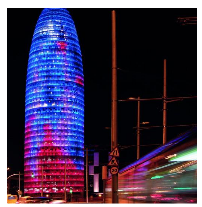
GLORIES TOWER VIEW POINT

Return to Hostel Pere Tarrès, dinner and accommodation