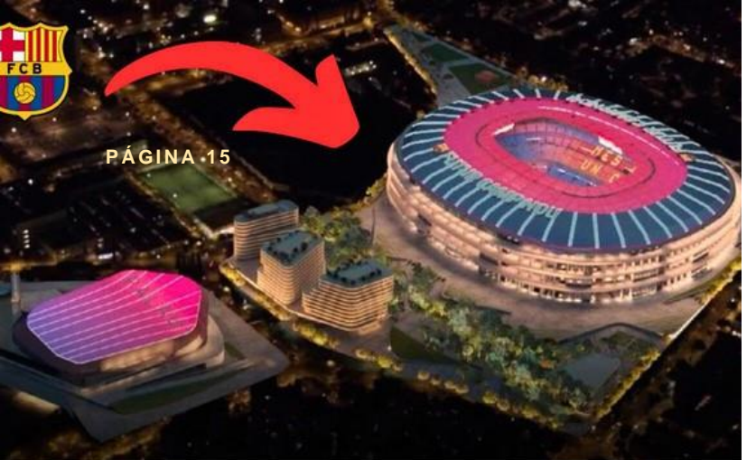
BARÇA NEW FIELD