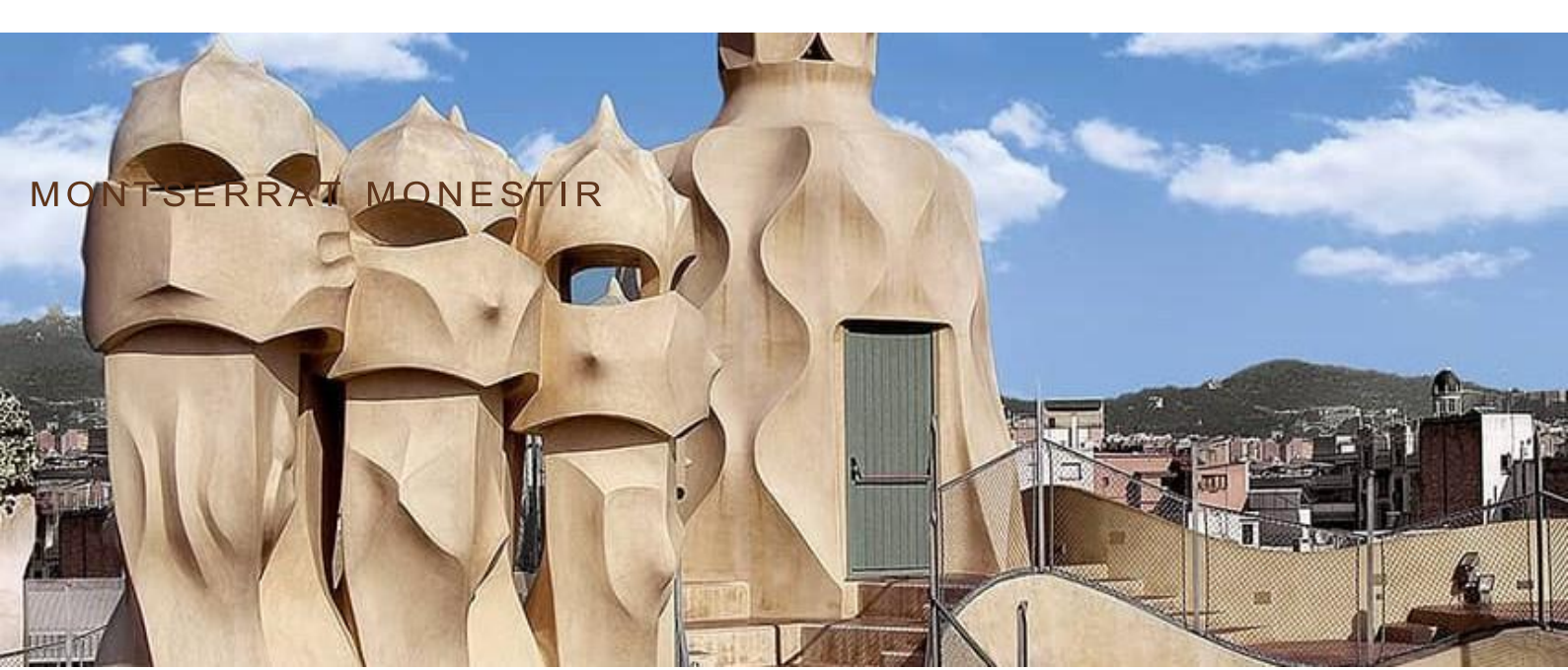
ROOFTOP OF LA PEDRERA

Located just 10 minutes from the main train station in the city, Sants station, and with numerous bus, metro and tram lines less than 5 minutes away.