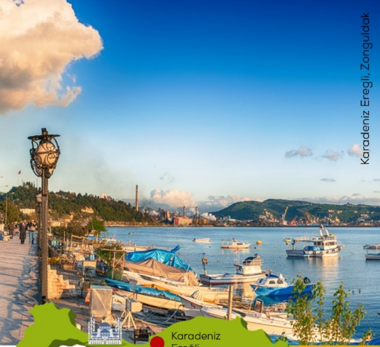
Karadeniz Ereğli, Zonguldak